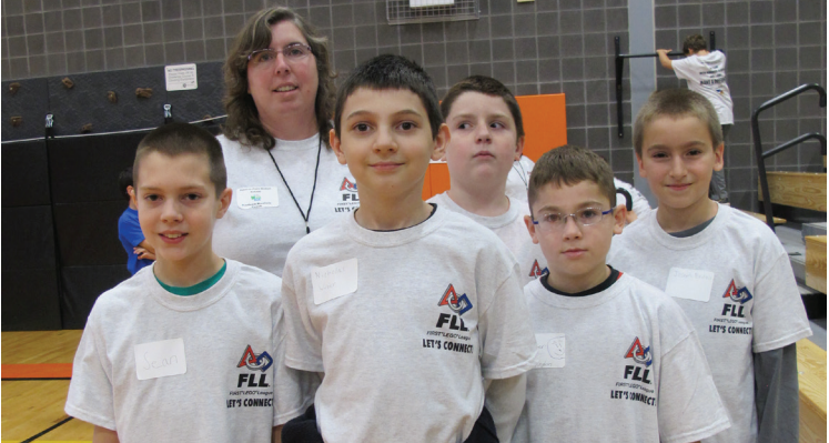
Palermo Elementary School First LEGO Team paused for a photo.